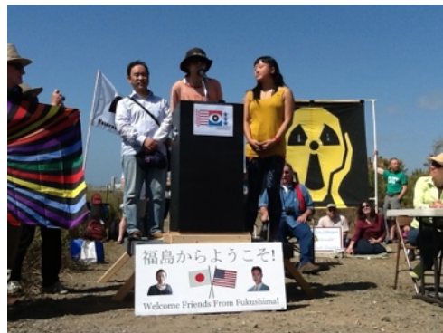
Guests from Fukushima spoke, in the shadow of the San Onofre Nuclear Generating Station.