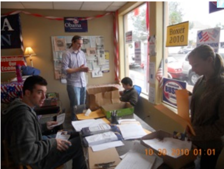
OFA (Organizing for America) Get Out the Vote