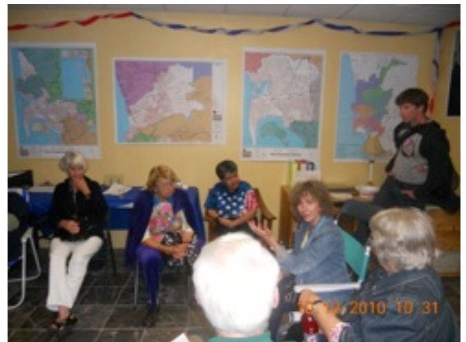
Brown-Whitman Debate Discussion