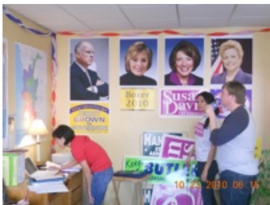
Get Out the Vote