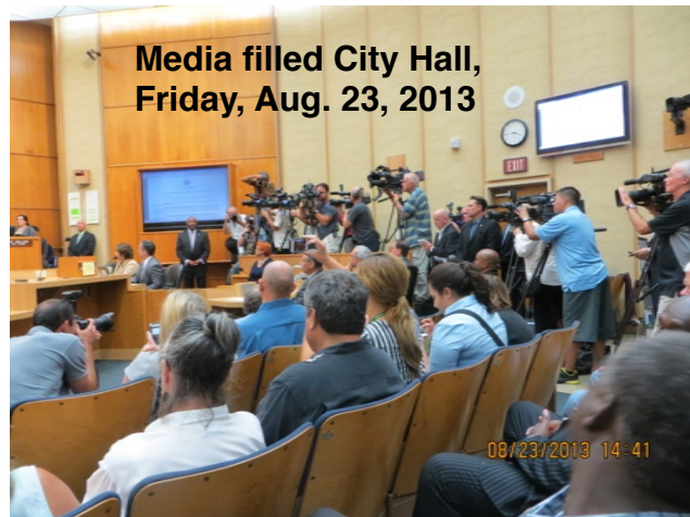
Media filled City Hall, Friday, Aug. 23, 2013