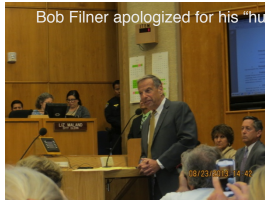
Bob Filner apologized for his "hubris"